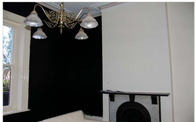
4) Affected parts of playroom shielded.