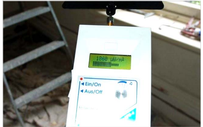
2) Very high EMR reading of 1860 microwatts per metre squared prior to shielding.