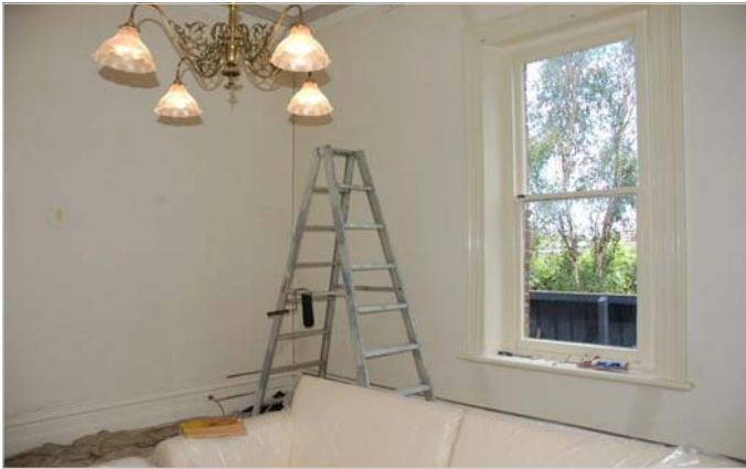
2) Very high EMR reading of 1860 microwatts per metre squared prior to shielding.