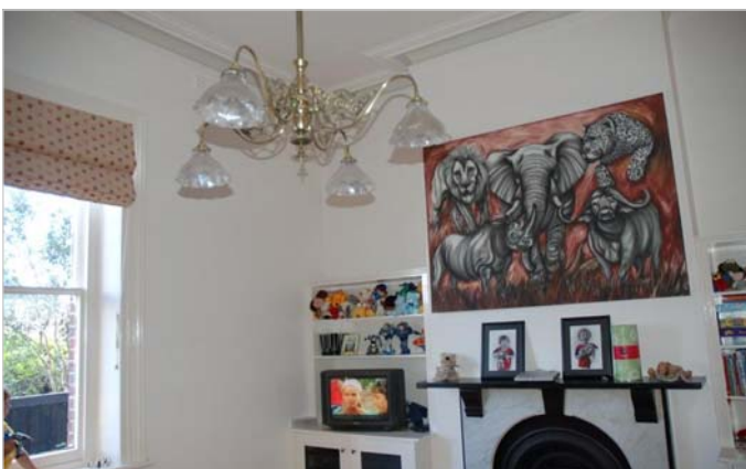
5) Finished over painted playroom.